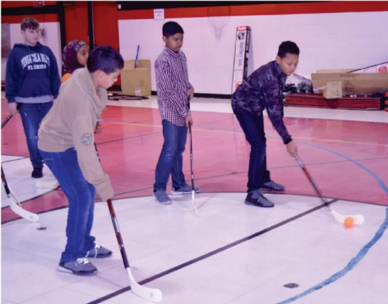
Members of the Blues Street Team visited McNair Elementary on Jan. 7 to start a week-long program of teaching street hockey during P.E. class. (Full story and more photos on page 10.)