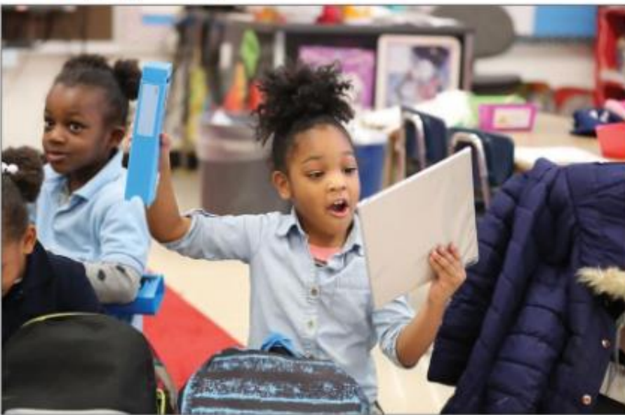
Since 2002, KidSmart has been able to provide over $17 million dollars-worth of free school supplies in the St. Louis area.